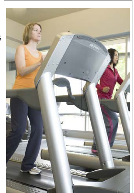
Proper exercise is key in the treatment of osteoporosis.